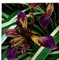
Iris foetidissima 'Variegata'

Although it does not flower as readily as other stinking iris cultivars (pp90–97), this variegated selection has striking foliage. The picture shows a clone with deeper blue flowers than most plants grown under this name.