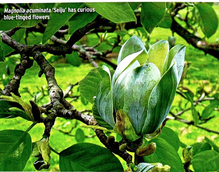
Magnolia acuminata 'Seiju' has curious blue-tinged flowers

Over the last 50 years or so more than 100 selections and hybrids of 'yellow' magnolia have been