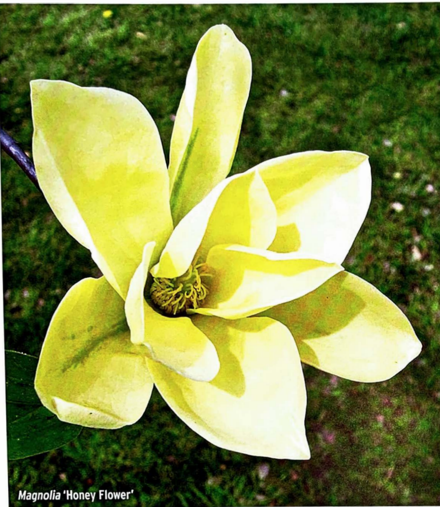
Magnolia 'Honey Flower'

yellow-flowered magnolias at Wespelaar Arboretum. This is a surprise, as the competition is tough against usual winners such as 'Anilou', 'Daphne', 'Green Bee' or 'Honey Liz'.