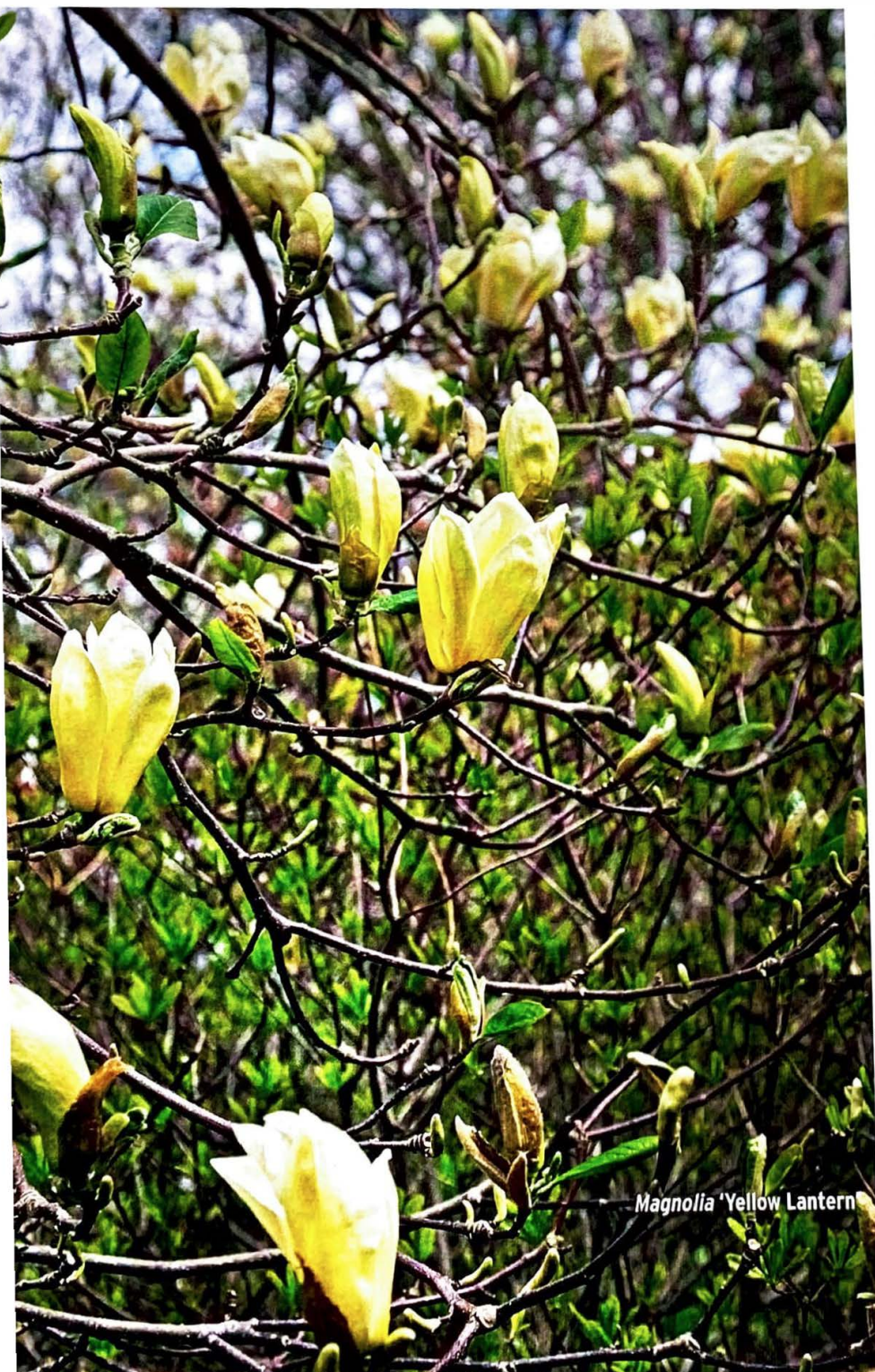
Magnolia 'Yellow Lantern'

Although selected at Wespelaar Arboretum, 'Butterbowl' is the result of a cross made by August Kehr in 1992. He hybridized 'Yellow