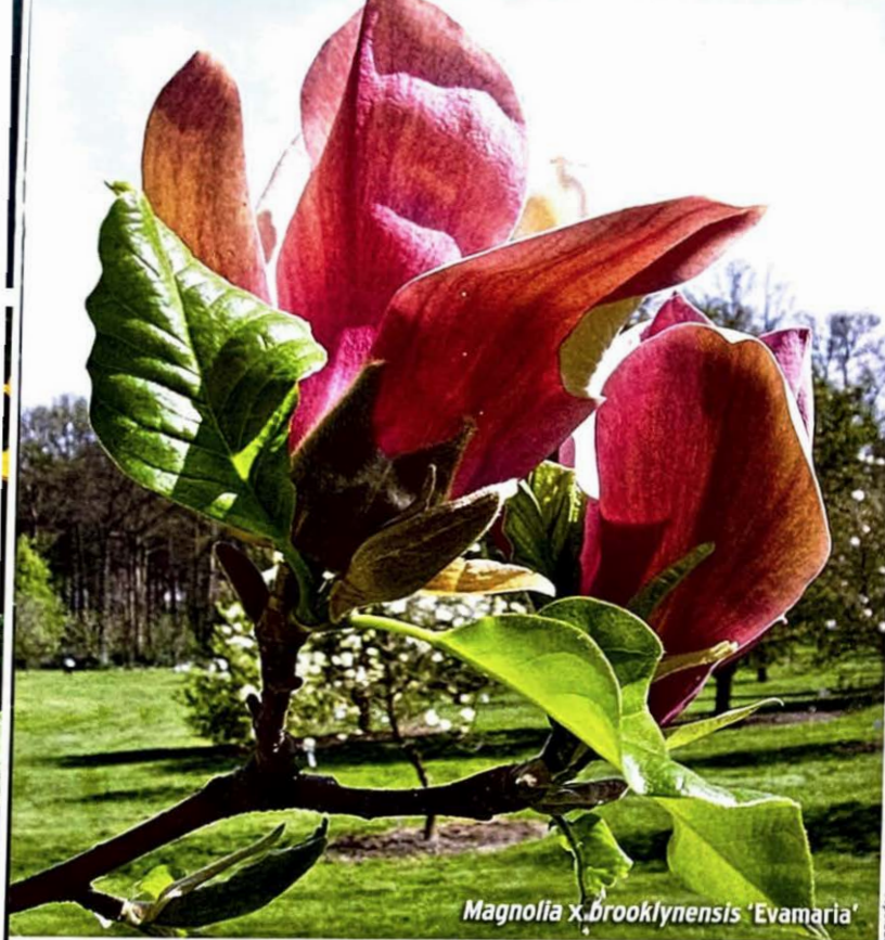
Magnolia x Brooklynensis 'Evamaria'