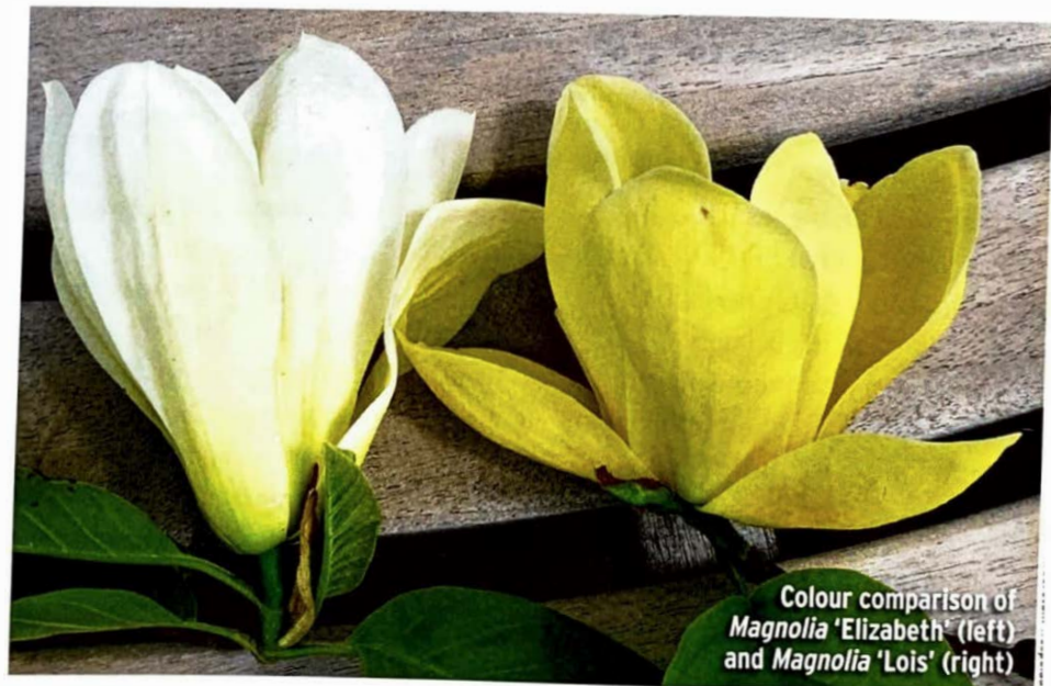
Colour comparison of Magnolia 'Elizabeth' (left) and Magnolia 'Lois' (right)

The search continues for the perfect yellow Magnolia . It needs to have a compact habit; to flower freely; to flower precociously before the leaves appear, but late enough to escape frost; to have an intense yellow colour; and to have the poise and elegance of the blooms of M. denudata . We are not there yet, but the recent selections described below are getting close. They are arranged in approximate chronological order of release date.