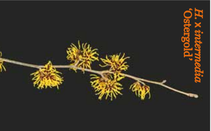
H. x intermedia 'Ostergold'