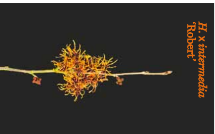
H. x intermedia 'Robert'