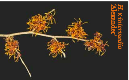
H. x intermedia 'Alexander'