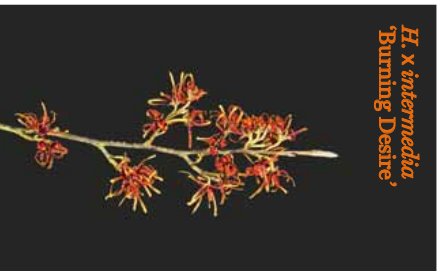
H. x intermedia 'Burning Desire'