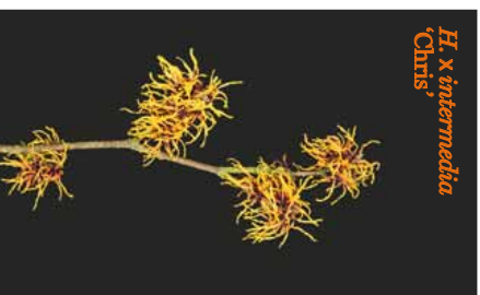
H. x intermedia 'Chris'