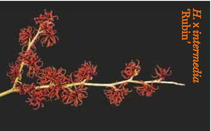
H. x intermedia 'Rubin'