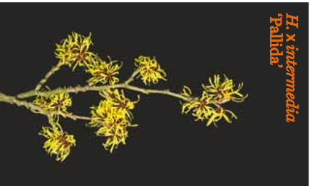
H. x intermedia 'Pallida'