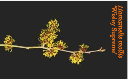
Hamamelis mollis 'Wisley Supreme'