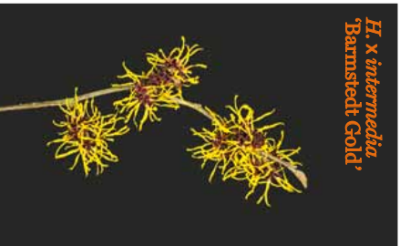
H. x intermedia 'Barnstedt Gold'