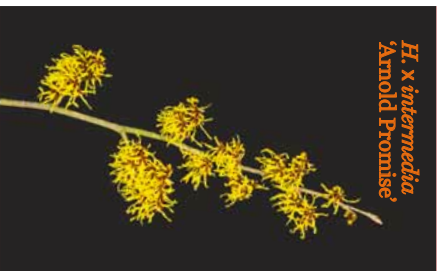
H. x intermedia 'Arnold Promise'