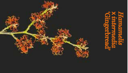
Hamamelis x intermedia 'Gingerbread'

The spidery blooms of Hamamelis x intermedia 'Jetera' (above left), 'Orange H. x intermedia 'Vesna' (above) with red H. x intermedia 'Blanc' , an old but still popular red-flowered selection.