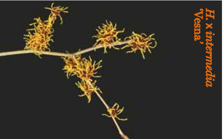
H. x intermedia 'Vesna'