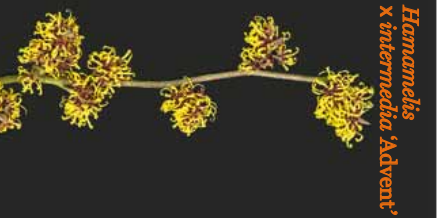
Hamamelis x intermedia 'Advent'

The Trials Forum (above left) examining flowers of Hamamelis on trial. Some which hazels, such as H. x intermedia 'Arnold Promise' (above), develop superb fiery autumn foliage colour, extending their season of interest.