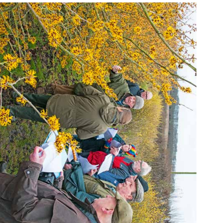
TGC / FP / MARTIN HUGHES-JONES