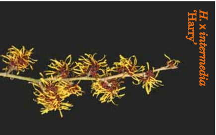
H. x intermedia 'Harry'